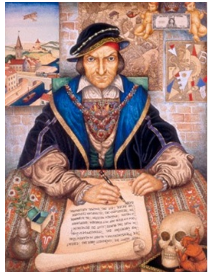
The Scribe, Arthur Szyk