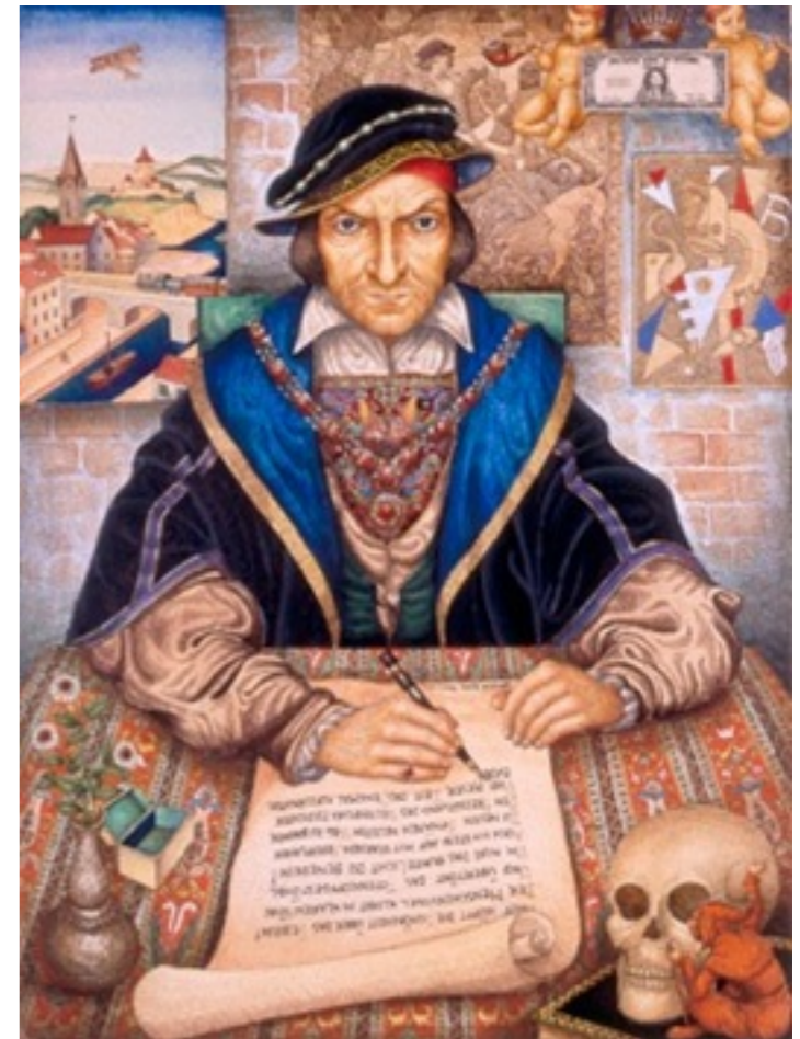
The Scribe, Arthur Szyk